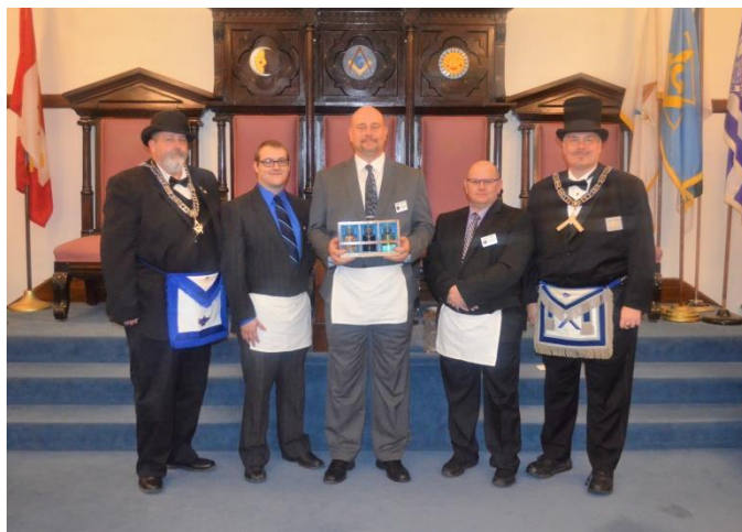
Our Brothers receive More Light!