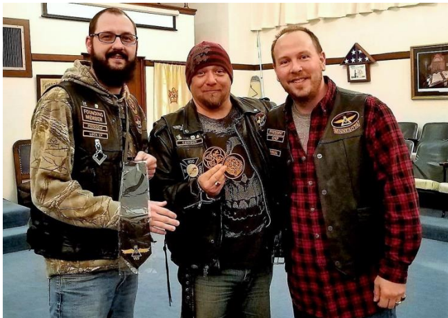
Giving gifts to our Grand Chapter Officers!

We are an appended body, an organization of men that love motorcycles. We meet at Anoka Lodge. Our mission is to help and assist our Masonic Widows, Orphans or just Brothers in need.