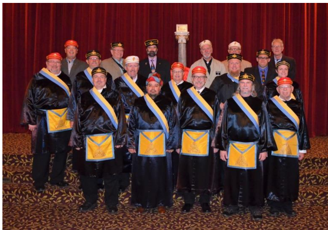
Anoka’s Adopted Degree!

Breing dark the following week for Thanksgiving, we end the month with the 30 th Degree, the terminal Degree for the Council of Kadosh!