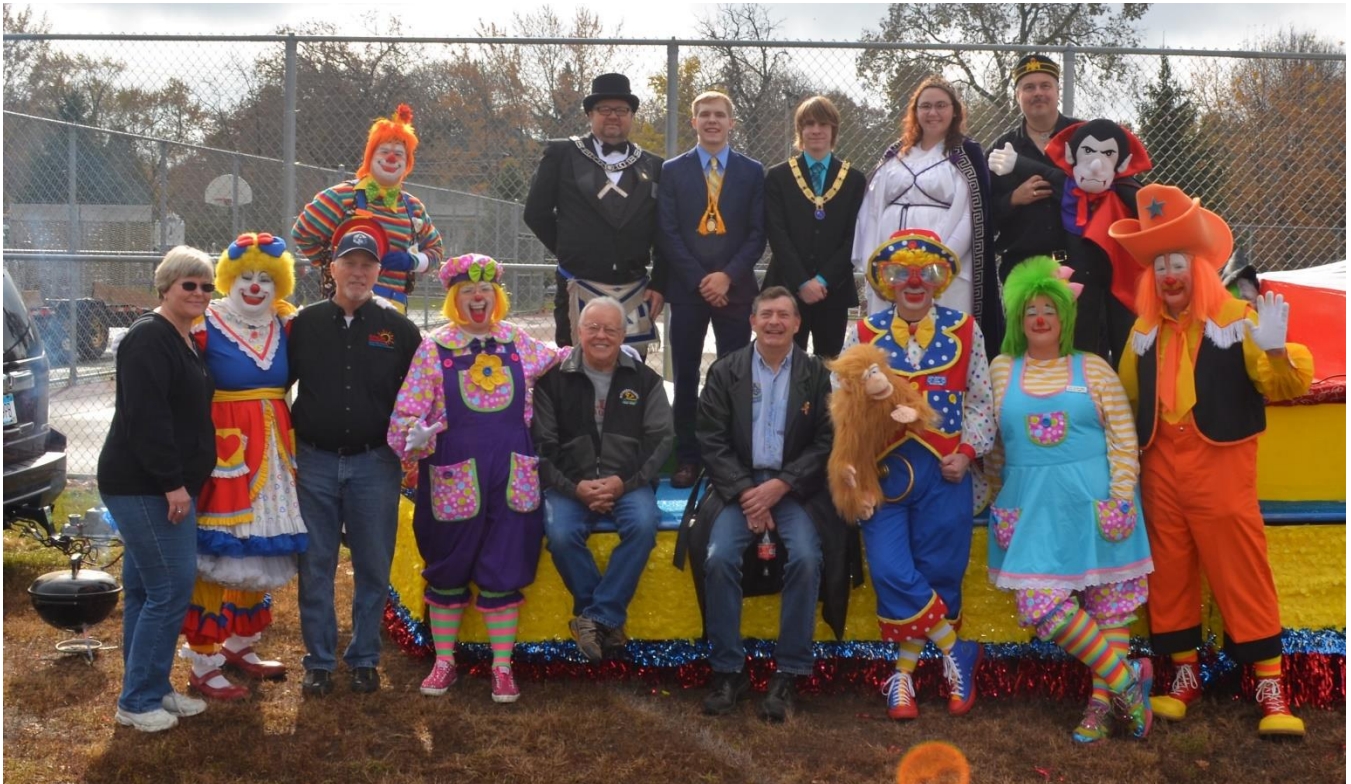
The Anoka Masonic Family in the Halloween Parade!