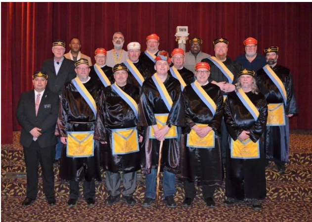
Anoka Lodge puts on it's Adopted Degree!

We did manage to put on the 20 th Degree or Anoka Lodge #30's Adopted Degree as it were and look forward to the rest of the Degrees going ahead as planned.