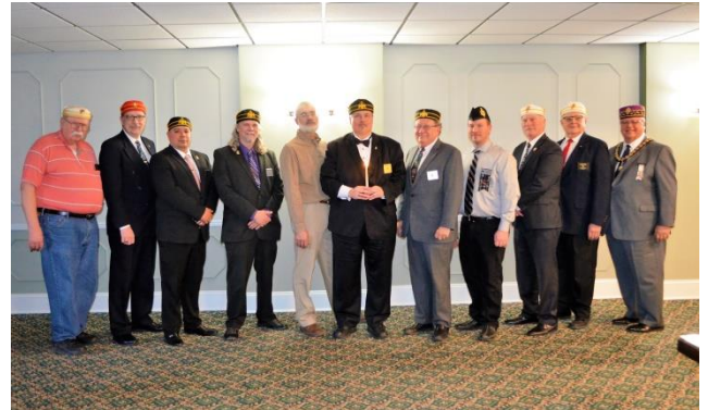
Anoka Lodge Members attend the Ceremony of Remembrance & Renewal!