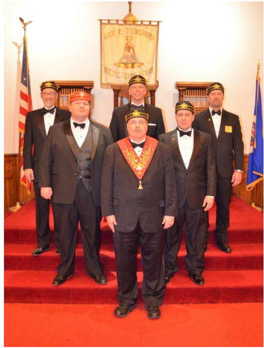
Chapter of Rose Croix Officers

Before going "Dark" for most of the Summer, we will hold our Annual Feast of the Consistory and "Scottie" awards. This is where we honor all those who work so hard to put on the 29 Degrees twice a year.