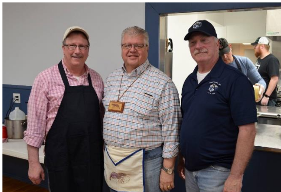
Shrimp Dinner 2019 Committee Heads