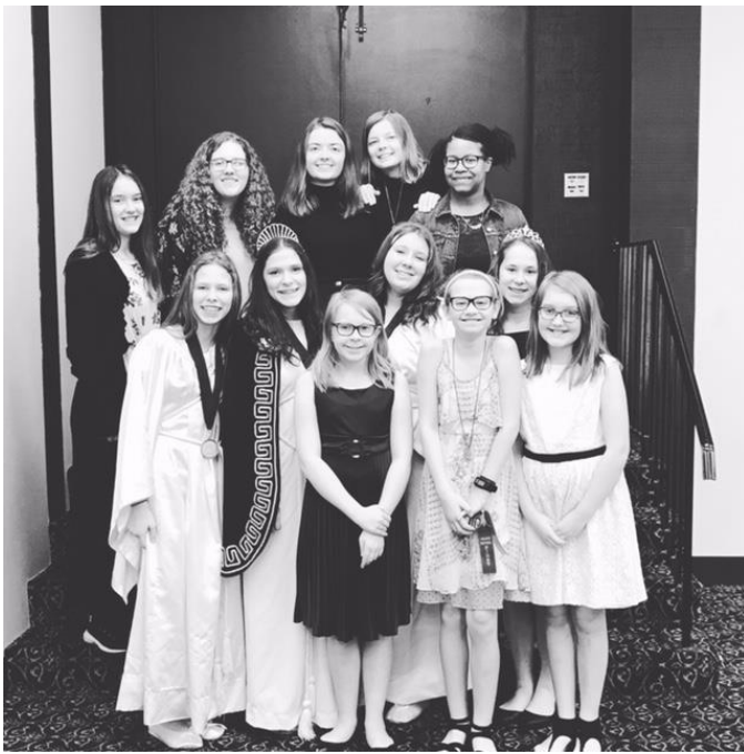
Bethel 48's Jobs at Grand Bethel