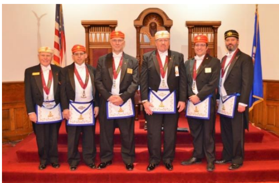
Lodge of Perfection Officers