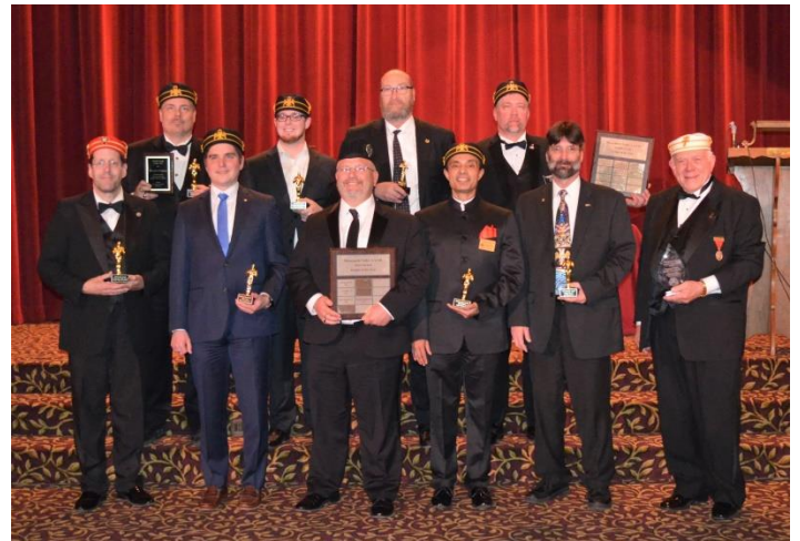
All the winners or their Acceptors for the night!