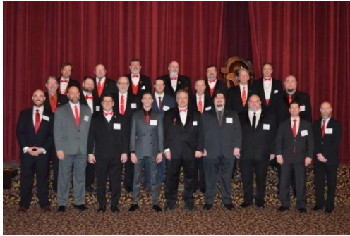
A Few of our Companions at the One Day with the 14 New Members!

The first of the One Day to York Rite weekends started at the beginning of February and the members of Anoka Shekinah #104 were privileged to have 14 new Companions come through that day.