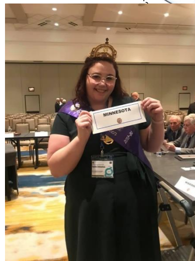
2020 Conference of Grand Masters Louisville, Kentucky