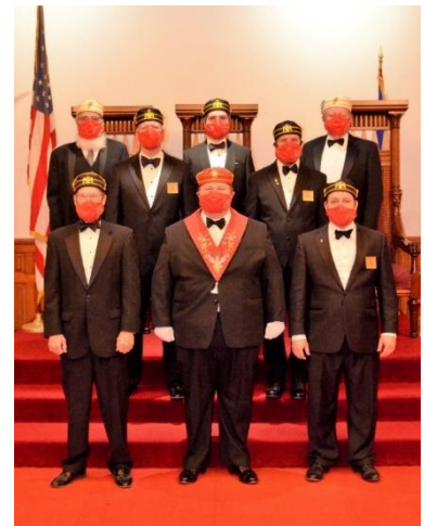
The Rose Croix Line