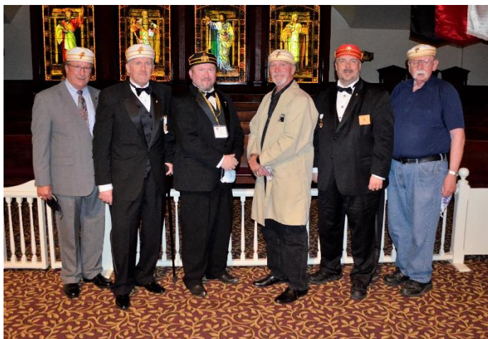
Anoka Lodge #30 Brothers at the Reunion!