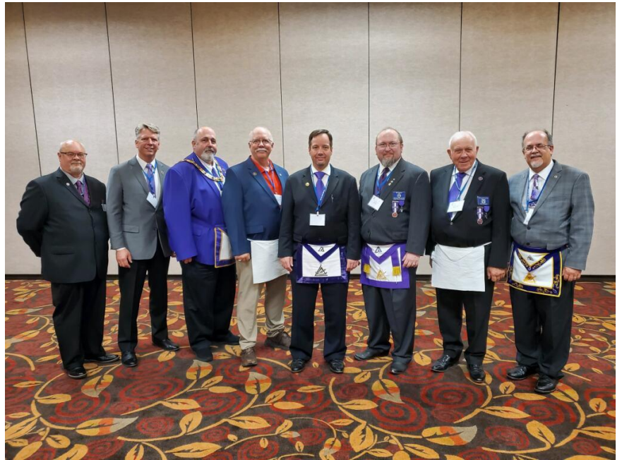
Zabud Council members attending the the York Rite Grand Session

Zabud Council #10 will be dark during the months of July and August per our bylaws. I wish everyone a fun and safe summer. See you all in again the fall!