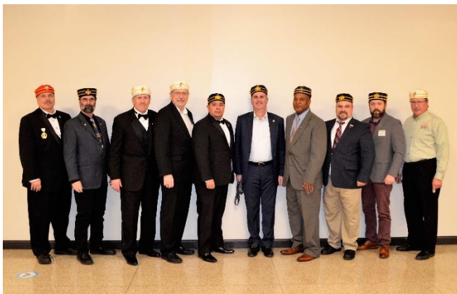
Some of the Anika Lodge members in attendance

Just a reminder that the Spring Cycle of Degrees will be starting soon (January 13 th ) and petitions must be in by January 4 th , so if you have any questions or interest in learning more about the Scottish Rite, please don't hesitate to reach out and ask!