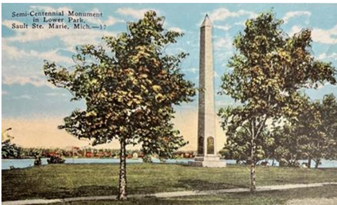
Semi-Centennial Monument in Lower Park, Sault Ste. Marie, Mich.—17