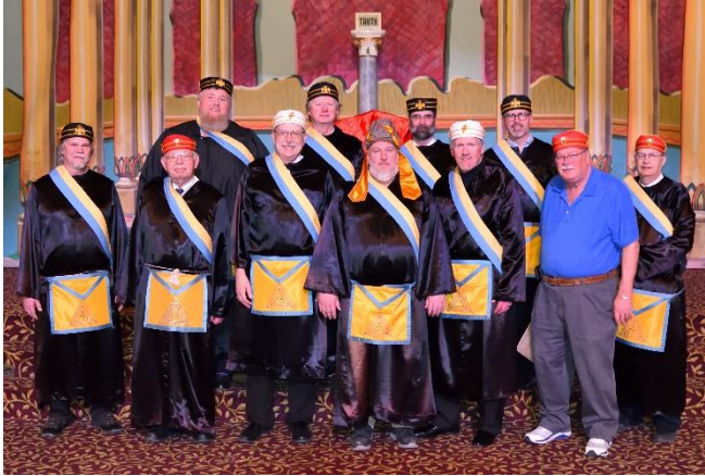
The 20 th Degree