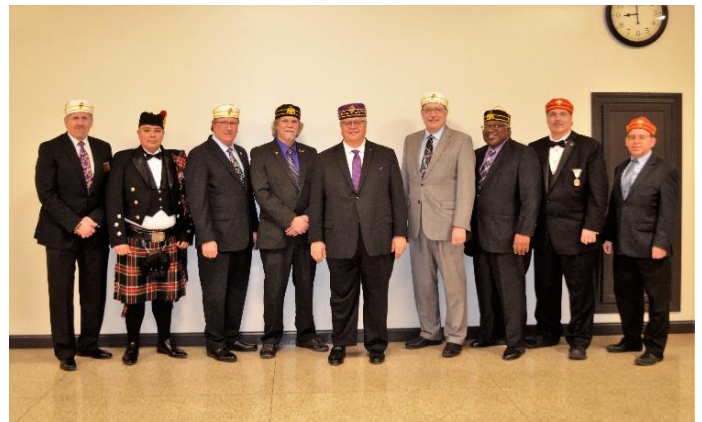
Anoka Lodge #30 at the Mystic Banquet

As we move into April, we work to finishing the Spring Cycle and holding our Spring Reunion, or "One Day" (Which is actually two days). On Tuesday, April 28 th we will confer the 4 th & 14 th Degrees and finish the reunion on Saturday, April 30 th with the 18 th , 30 th & 32 nd Degrees, Culminating the Spring Class as well!