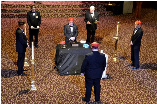
Ceremony of Remembrance & Renewal