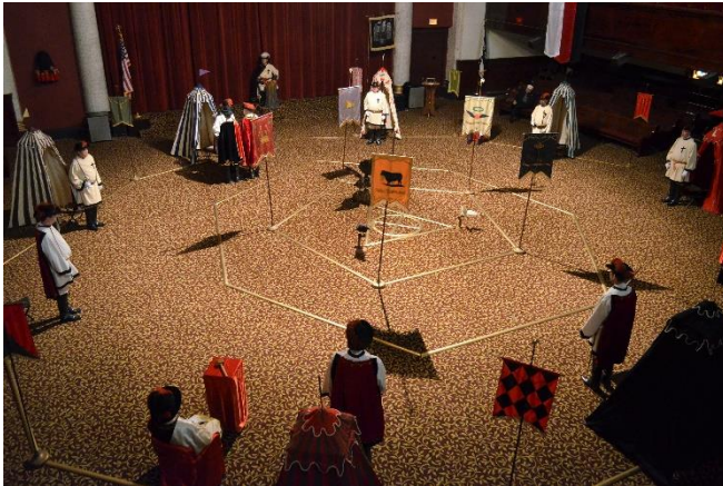
The 32 nd Degree (A previous year)

This will happen during the Completion of the Spring Reunion on April 28 th & 30 th , where not only the Spring Class will finish their Degrees, but also those members going through the 2 Day Reunion Class.