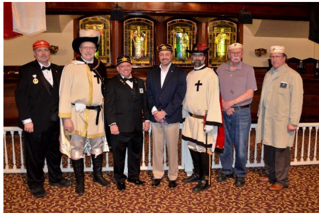
Two of the Three Anoka Brothers who became Masters of the Royal Secret

The Fall Cycle will start in September with a few other activities at the end of August. If you are interested, please reach out and get your petitions in by the 1 st Tuesday in August!