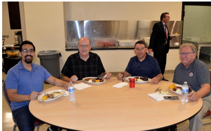
A few of the Anoka Lodge Brothers

Of course, the Fall Degree Cycle begins right on September 1 st and if you did not get signed up prior to this newsletter coming out you will have to wait till January.