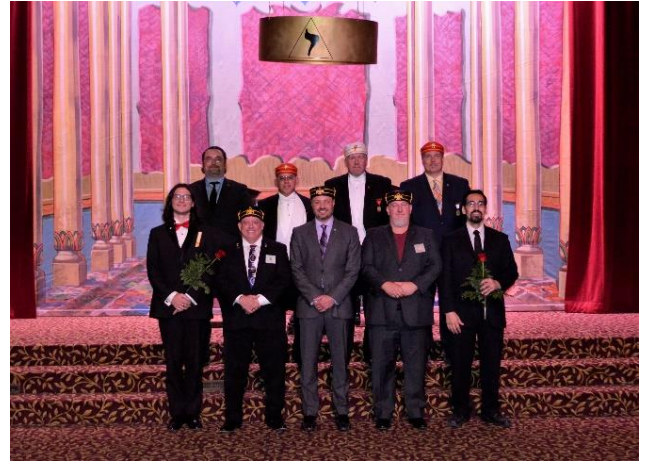
Brothers and those receiving their 14 th Degree Rings at the Feast of Tishri