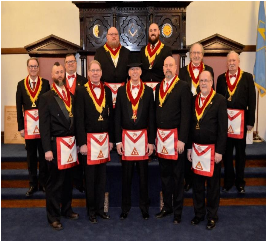
The 2023 Officers of Shekinah #52