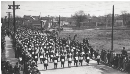
A view from 1923