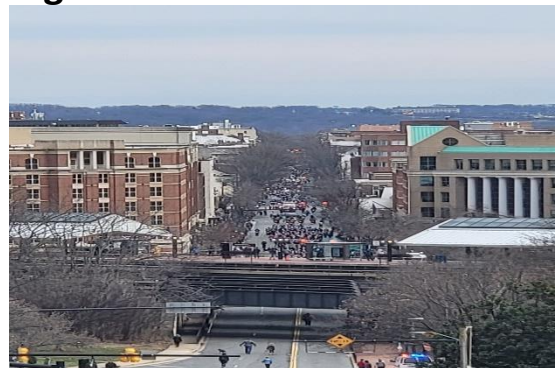
A view from 2023