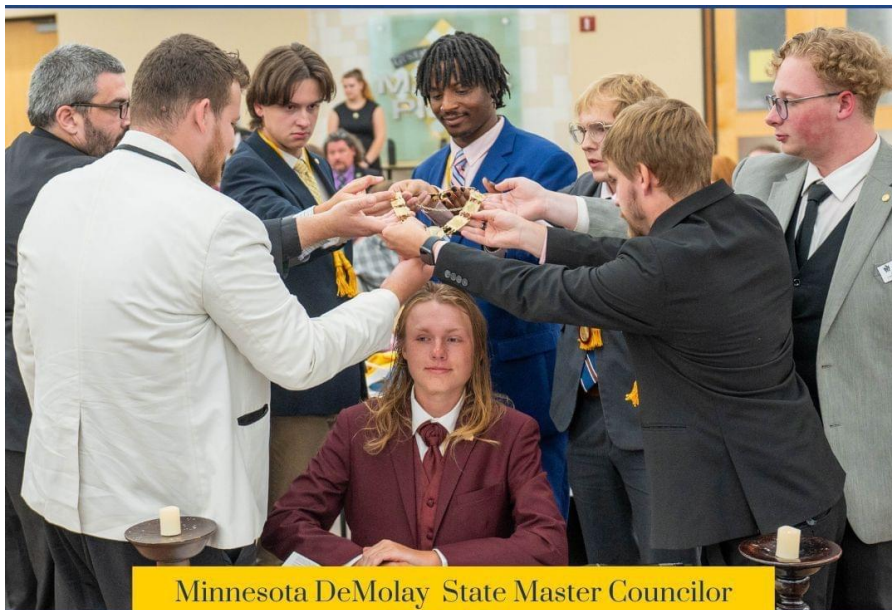
Minnesota DeMolay State Master Councilor 2023-2024